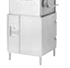
Dishmachine, Pg. 14