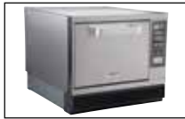
High Speed Oven, Page 8