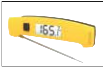
Folding Thermometer, Pg. 3