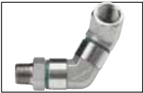
SwivelKing, Page 13