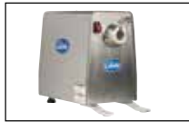
Power Drive, Page 5