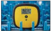
Dishwasher Thermometer, Pg. 3