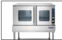
Provection Oven, Page 9